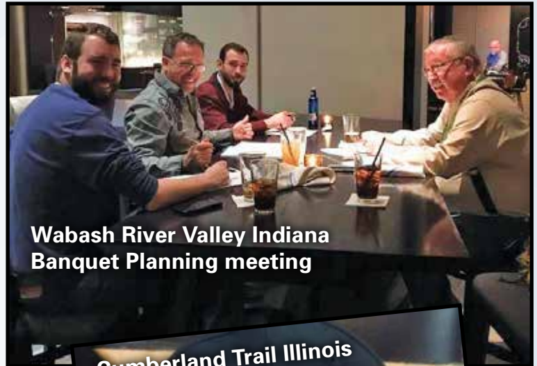
Wabash River Valley Indiana Banquet Planning meeting